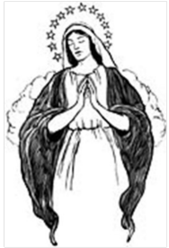
Illustration 2001 K. Sullivan.