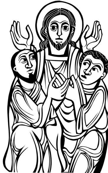
Twenty-Third Sunday in Ordinary Time, Year A.

Do Christians correct and care for each other? Around the world, we are bound together in Christ Jesus. We are not perfect, but we ought to urge each other to better follow the Lord. In Christ, we can reconcile and be reconciled. Love is the one thing that cannot hurt your neighbor; it is the answer to all the commandments. When we gather in his name, the Lord is with us. If the Lord is with us, who can be against us?